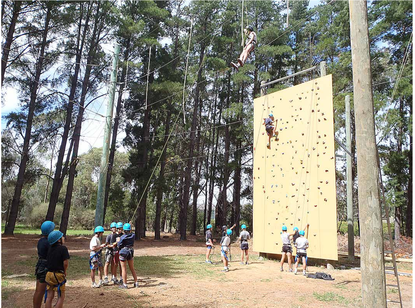
Sacred Heart students enjoying the 'Phase 1' course at Douglas Scrub. See p 7

Journal of the Outdoor Educators' Association of South Australia Volume 32 No 1, May 2014